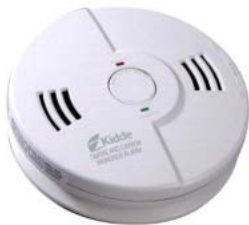
Front of Unit