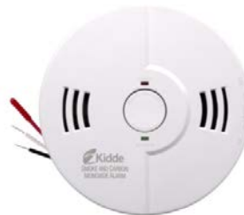
Front of Unit w/ Wire Connectors